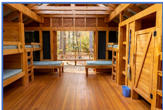
Picture to the left: Inside a wooden tent. Picture to the right: Inside a cabin

Each living unit has portable toilets (primarily for night and early morning visits) and a hand-washing/tooth-brushing station located just a few steps away. Each living unit also has a fire pit and picnic tables. The central shower house has composting toilets, sinks, and individual shower stalls with private dressing areas, and it's located near the playing field, Health Center, and office. Showers are scheduled for each unit several times per week. There are also flushing toilets near the dining hall.